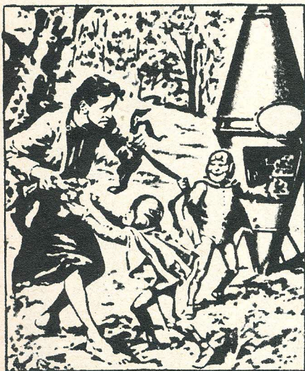
Artist's impression of the incident, from La Comenica del Corriere .

Vigorous, lively, they were talking away "as though they were Chinese. They kept saying 'liu,' 'loi,' 'lau,' 'loi,' 'lai,' 'liu.'" (Creighton's comment: